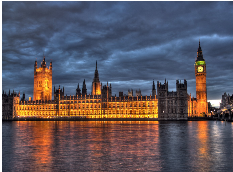
The Houses of Parliament

If we didn't have a democracy, an individual could make all the laws which could then be abused to further the agenda of that individual and may not reflect the will of the people.